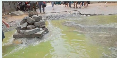
Sewage flowing on to the road in Spice Garden, Marathahalli.