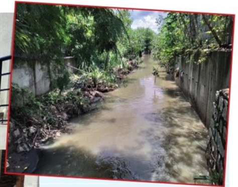
(Left) The place where a temporary platform was constructed to park vehicles. (Above) Actual width of the stormwater drain outside the educational institution

near future if the Bruhat Bengaluru Mahanagara Palike (BBMP) and elected representatives continue to turn a blind eye towards encroachment of stormwater drains across Bengaluru.