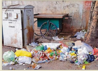
Trash dumped along Ayyappa Swamy Temple Road, Vidyapeeta, is an eyesore.