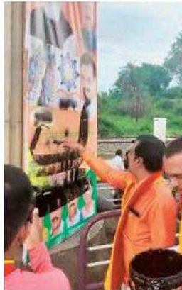
Activists painting banners with Hindi words black on Mysuru Road. ■ SPECIAL ARRANGEMENT

All such illegal boards on Mysuru Road will be removed, says BBMP