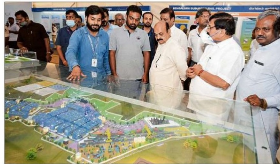
Chief Minister Basavaraj Bommai takes stock of the preparations at Kommaghatta in Bengaluru where Prime Minister Narendra Modi will address a public meeting on Monday.

He will also lay foundation stone for Bagchi Parthasarathy Hospital. He will then head to the Jnanabharathi campus to unveil the statue of Dr B R Ambedkar and inaugurate