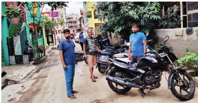
Residents waiting at a garage to get their bikes repaired