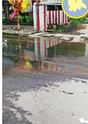
Drain leakage opposite Indira Canteen, Halasuru Metro and Murphy Town market, Indiranagar.