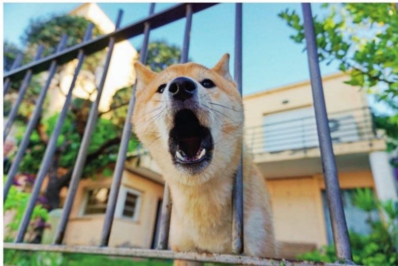
Residents say the constant barks is making life unbearably noisy for them