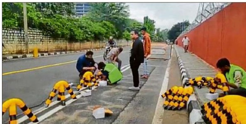
The cycle lane at SK Road, Doddanekundi.

"When viewed from the top, the design resembles an 'X'. It is tilted diagonally towards the bike lane traffic, making it easier for cyclists to exit the lane whenever they want while also making it more difficult for automobiles to enter because they would have to make sharp turns. Because the material is recycled four times, it is valuable only as a pollard. This reduces chances of theft."