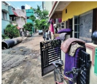
Beds, pillows and clothes outside their homes for drying