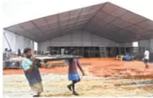
Workers erect a stage at Kommaghatta

"A total of 40,000 people can be accommodated. It is a combination of ordinary seats as