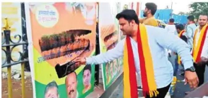
KRV activists blacken welcome banners in Hindi on Mysuru Road on Sunday

Posters were put up to welcome PM Modi; Only Hindi not acceptable, they say