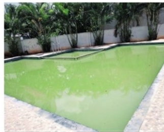
Condition of a swimming pool in an apartment complex adjacent to the stormwater drain