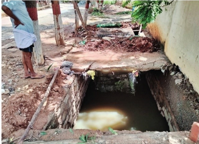
Inside an educational institution the size of a stormwater drain has shrunk

"Many of our vehicles are damaged. We have pressed our house keeping staff into cleaning the premises. It will take two to three days for us to keep the apartment premises