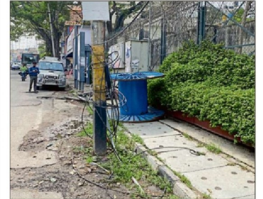
Cable spool lying on a footpath next to the Maruthi Seva Nagar bus station.

Sewage flows on to the road in Spice Garden, Marathahalli, making it inaccessible. Can anyone help? Vindhya