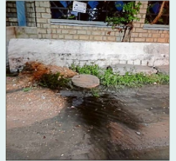
An overflowing sewage chamber raises a stink.

I request the authorities to take up this issue on a war footing and find a solution before the school