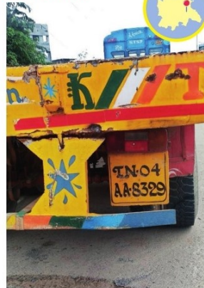
Trolley lying idle for many days near Karunashree Layout, Medhahalli. It is blocking the footpath.